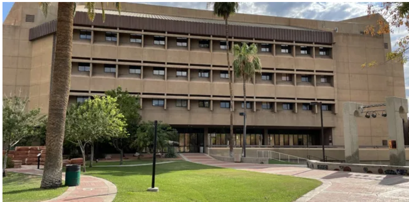
Glendale's current City Hall building was constructed in 1984.

Glendale has six city council members who are elected from geographic districts and a mayor who serves the city at large.