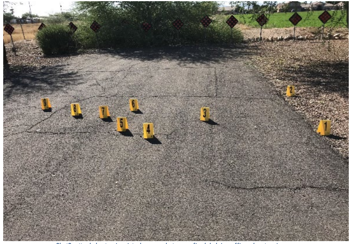
ShotSpotter helps to pinpoint where gunshots were fired, helping officers locate crime scenes