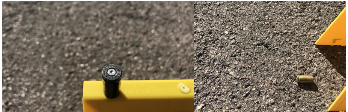
Spent shell casings from a ShotSpotter crime scene